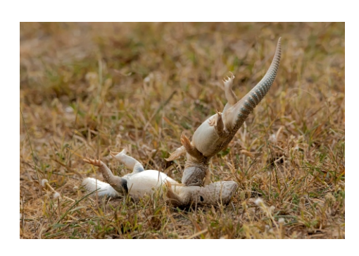
WILD WRESTLERS 2 MRINAL SEN CHAIRMAN'S CHOICE