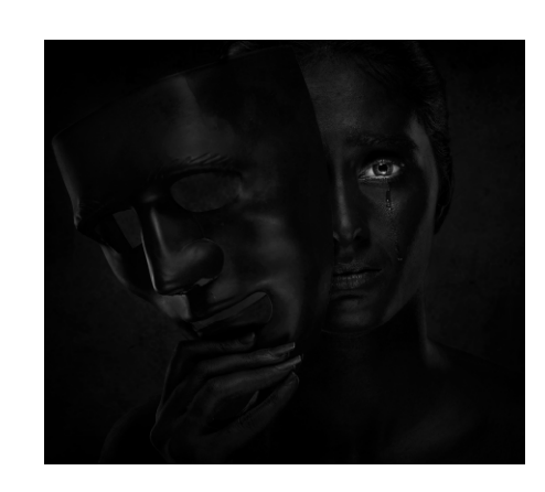
DARK MASK1 HAPPY MUKHERJEE IRIS SILVER