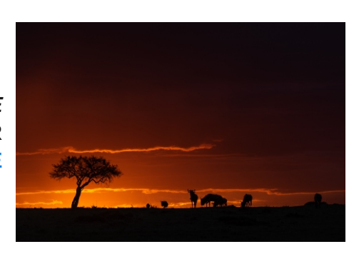
A MARA LANDSCAPE MANISH PUNDIR CHAIRMAN'S CHOICE