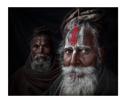
TWO SADHUS ABHISHEK BASAK CHAIRMAN'S CHOICE