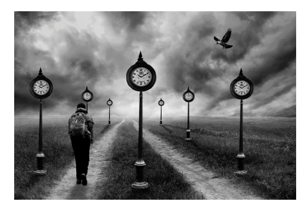
CLOCK WAY MONOJ BISWAS FIP BRONZE