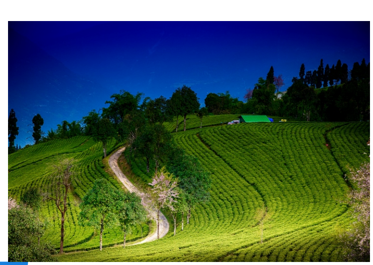
TEA GARDEN SHUVASHIS SAHA BEST LANDSCAPE