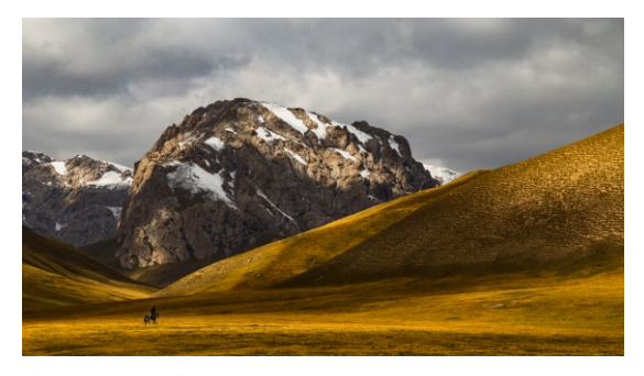
TIMETO GO HOME YOGESH MOKASHI CHAIRMAN'S CHOICE