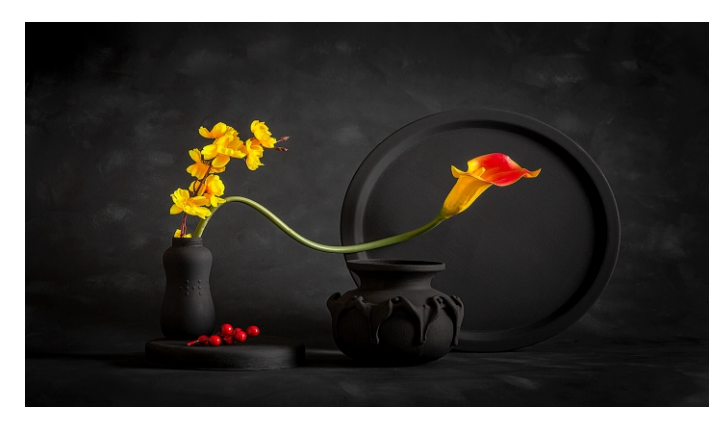
THE YELLOW FLOWERS PARVEEN JAGGI FIP BRONZE