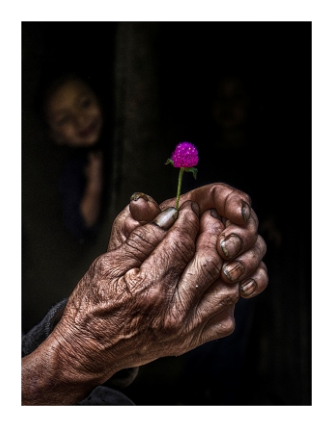
THE FLOWER SHUVASHIS SAHA IRIS BRONZE