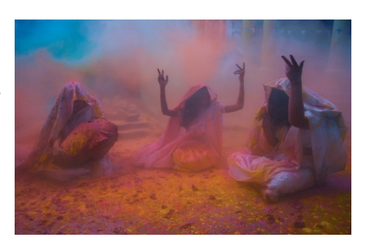
WIDOW HOLI, A TRIBUTE PRASENJIT SANYAL JUDGES CHOICE