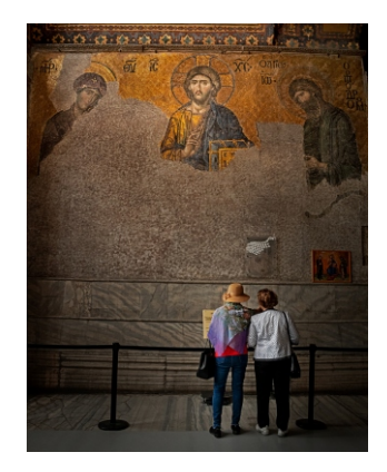
FRESCO OF HAGIA SOFIA SHELI MALLICK FIP BRONZE