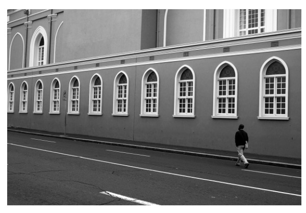
ONTHE WAY SAJAL GHOSH IRIS GOLD