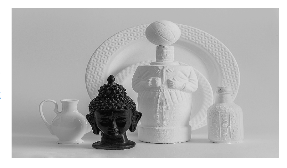
THE OLD MONK BUDDHA PARVEEN JAGGI BEST STILL LIFE