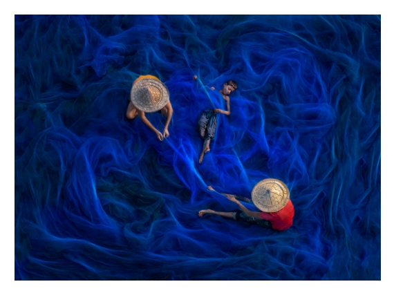
NET MAKING FAMILY HAPPY MUKHERJEE IRIS GOLD