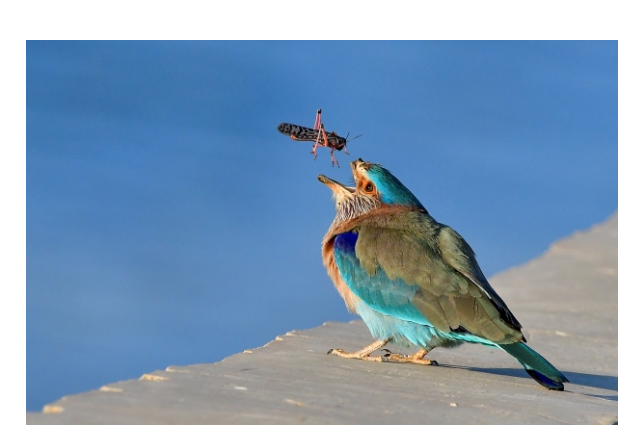
OVERCOMING DEFORMITY SUDHIR GAIKWAD IRIS BRONZE