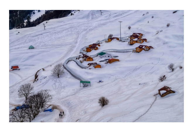
SCAPE AULI KRISHNENDU PATHAK FIP GOLD

Received Photographs - 565 Accepted Photographs - 144