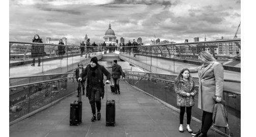
STRAIGHT FROM THE CHURCH PIU MAITRA CHAIRMAN'S CHOICE