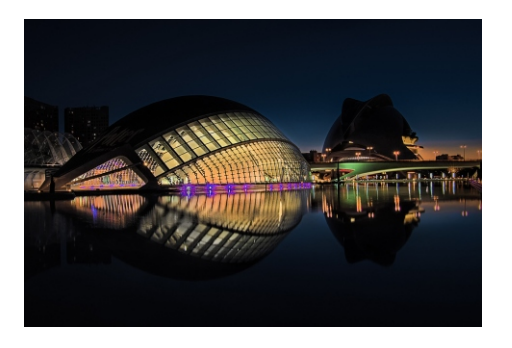
AT ARCHITECTURAL PARADISE MALINI DHAR CHAIRMAN'S CHOICE