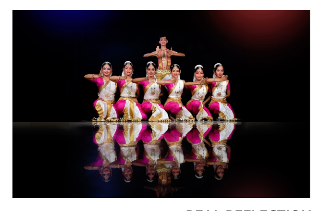
REAL REFLECTION MURALIDHARA K RAYARAMANE IRIS SILVER