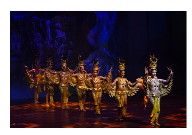
DANCING TIME SUMANTA KALLOL GHOSH IRIS SILVER