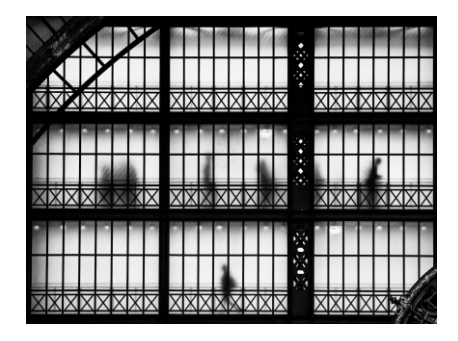
MOVING SILHOUETTES AT MUSEE D ORSAY VIJAYARAGHAVAN NARAYANAN CHAIRMAN'S CHOICE