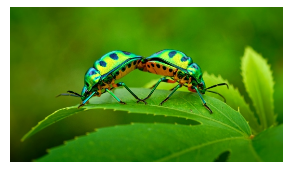
MATING BIJULAL M D JUDGES CHOICE