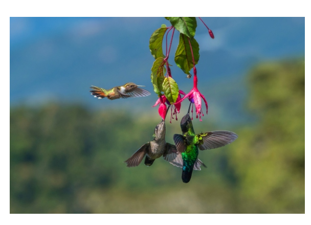
HUMMING BIRDS DRAWING NECTAR SATHYANARAYANA C.R. FIP SILVER