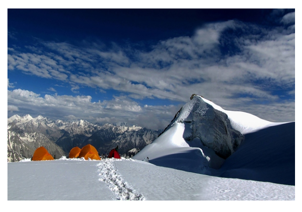
MT MANTHOSHA PRODYUT BHATTACHARJEE FIP SILVER