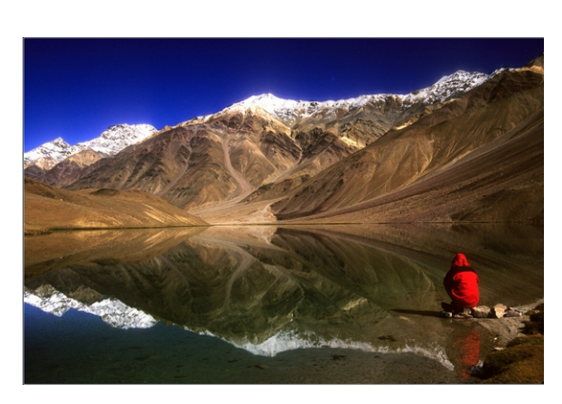
LAKE DIVINE. (CHANDRATAL) SUSILENDU BHATTACHARYA IRIS BRONZE