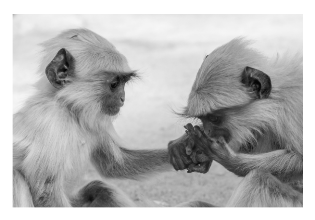
CARING SATHYANARAYANA C.R. FIP GOLD

Received Photographs - 587 Accepted Photographs - 169