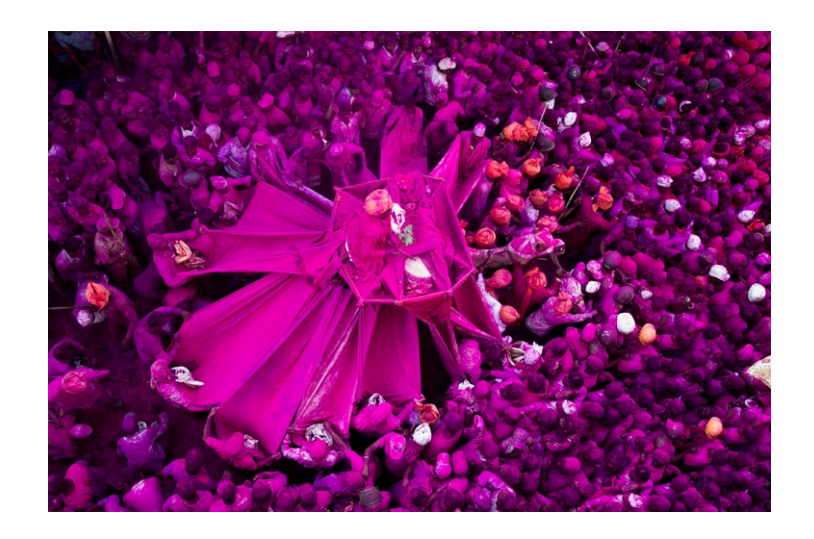
PINK FESTIVAL SHUBHAM KOTHAVALE BEST FESTIVAL